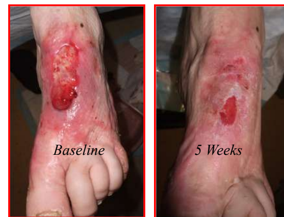
FIG. 4: The initial wound is covered with approximately 60% fibrous tissue, more proximally. After 5 weeks treatment with SilverStream, the wound shows a granular base, and no fibrotic or non-viable tissue.

Following treatment, 100% of the cases showed complete resolution of any signs of infection. Another critical element was the ability of SilverStream to aid in the development of granulation tissue, along with the removal of non-viable (necrotic or fibrous) areas. Overall, there was an average increase of 19% coverage in surface area with granulation tissue, and an average reduction of 9.4% of the wound area covered with fibrous and non-viable tissue. A typical clinical example of the development of granulation tissue and reduction in fibrous material can be seen in figure 4.