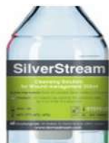
Fig. 1 SilverStream is currently available as a wound irrigant. It can also be used as part of a daily dressing protocol.

SilverStream, by EnzySurge, Ltd., Israel, was cleared by the FDA in 2009 for the treatment of a variety of wounds including Diabetic foot ulcers, Venous leg ulcers, and other types of difficult, non-progressive wounds.